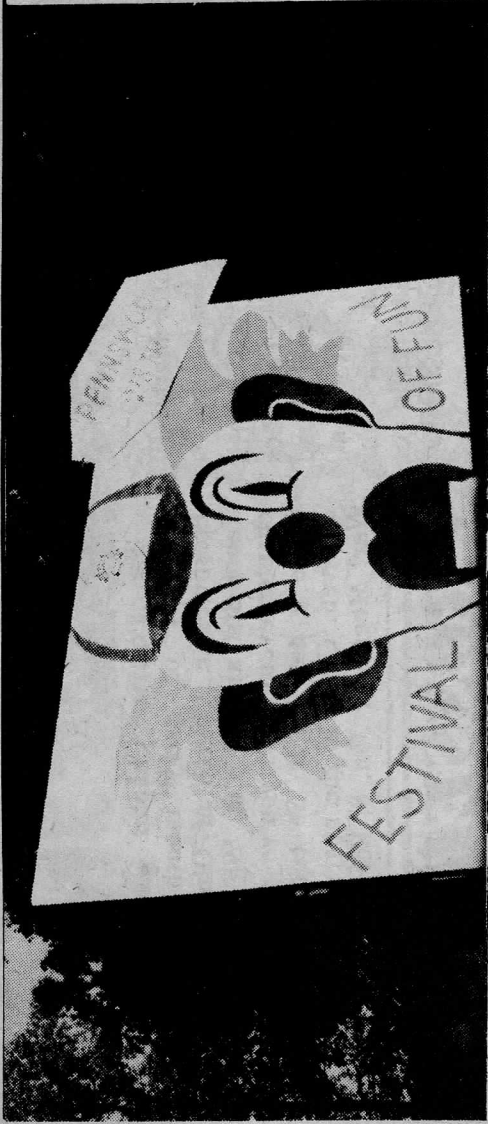
THE FUN FESTIVAL was centered around Penn's Woods' great clown sign.