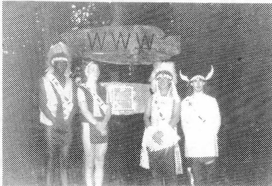
Left: Weekends include Brotherhood and Ordeal ceremonies as well as great socials, inter-chapter competitions and a Vigil Call-Out.