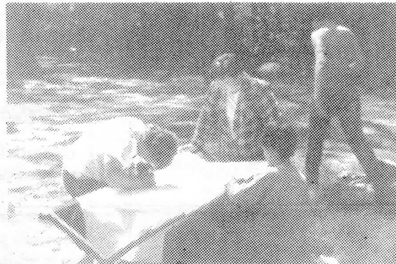
Right: Whether its fixing cots & tent platforms, painting, trail maintenance, carpentry, wiring or plumbing, the Lodge does its best to help maintain our Council Camps.

Each September our Lodge gathers at one of our council camps for a weekend of hard work and great fun known as the Fall Fellowship. This year's Fall will be held September 18-20 at Hart Scout Reservation.