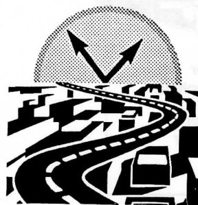
Time Travel Theme